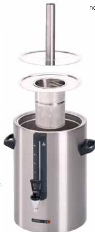
+ For making tea in a container, place the special tea filter with filler pipe.

Tea can be made just as easily with the same machine. A special tea filter with filler pipe is available for this. No tea leaves in the tea and no used tea bags to be cleared away. Perfect.