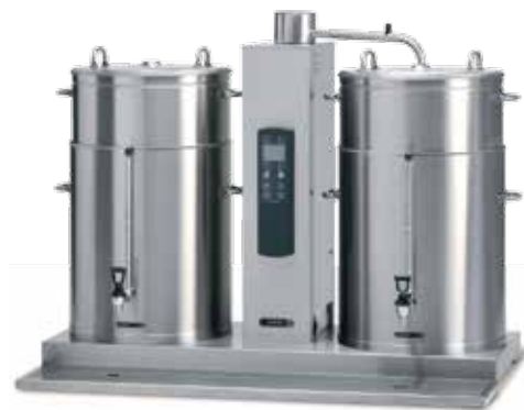
+ CB 2X40

+ The containers are available in 5, 10 and 20 litres. Containers with the same volume can be stacked.