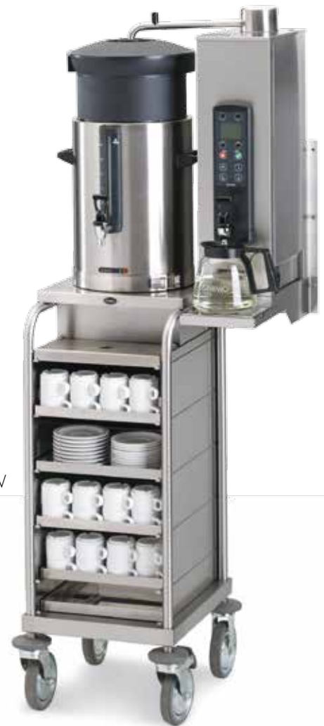
+ Serving trolley CB 10W

Animo also has an appropriate range of serving trolleys. Ask your supplier for the brochure.