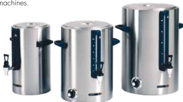
WKT-D - series

WKT-D storage water boilers have a double walled, stainless steel housing. The safe polyurethane insulation prevents the outside from becoming hot. The lid has been insulated as well. The WKT-D water boilers have a gauge glass, a non-drip tap and an adjustable thermostat as standard. Available in 5, 10 and 20 litre models, with (VA) or without (HA) fixed water connection, they are a perfect combination with the ComBi-line coffee-making machines.