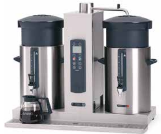
+ ComBi-line with two 10 litre containers: CB 2x10

ComBi-line machines offer the possibility of making large quantities of coffee and tea in a short time. A ComBi-line set-up is a combination of one or two continuous flow water heaters and one or two containers. The containers can be placed on a buffet, counter or serving trolley. The largest machine has a capacity of up to 1280 cups (160 litres) per hour.