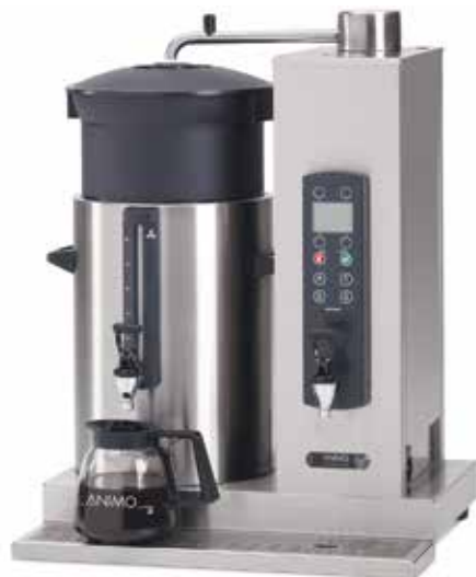
+ ComBi-line with a 10 litres container on the left side and a separate water boiler in the unit: CB 1x10W L.