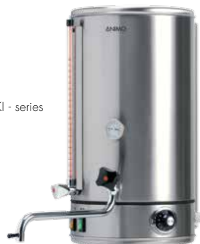
WKI - series