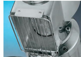
Griglia di protezione/rullo inox Protection grate/stainless steel drum