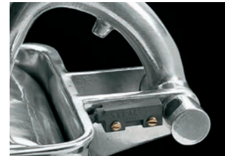
Microinterruttore su leva Micro-switch on lever